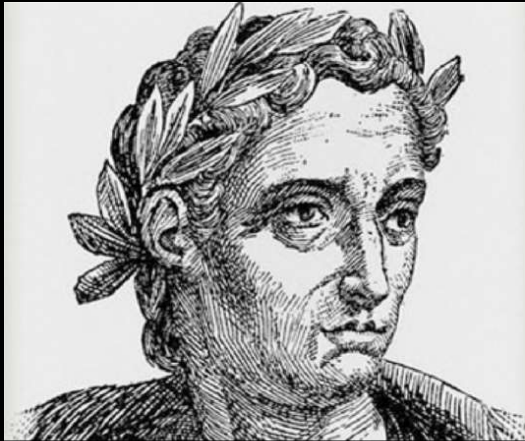
Pliny the Younger, letters c. 112 AD